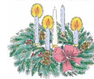
Advent Candle Lighting